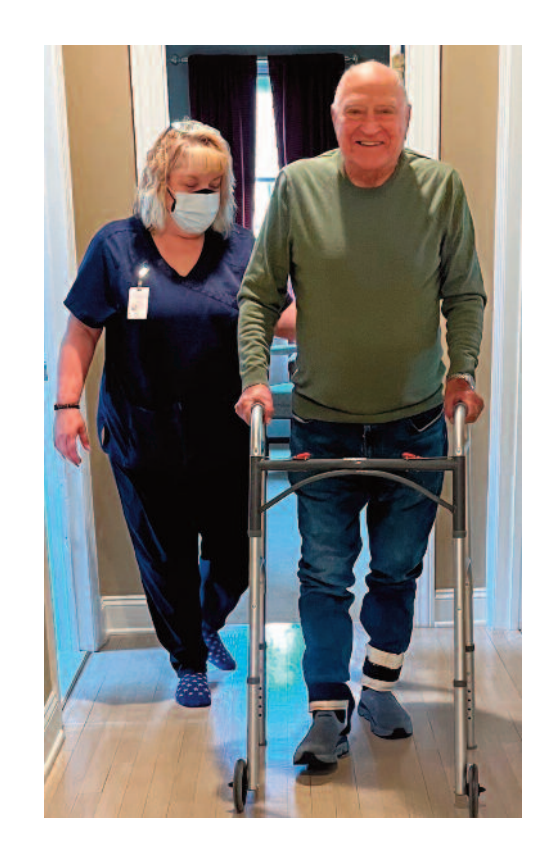
To Learn More About Our Therapy In Your Home

Call (908) 900-0100 or Email BCAH@BSHcare.com